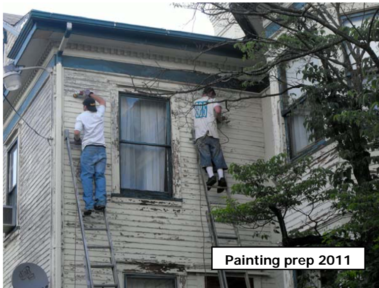
Painting prep 2011