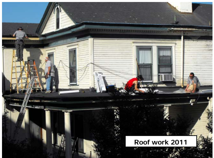
Roof work 2011