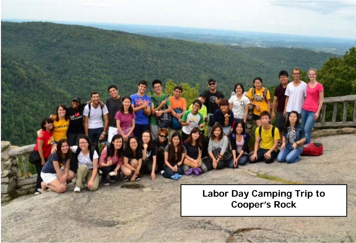
Labor Day Camping Trip to Cooper's Rock

InterVarsity Christian Fellowship is an interdenominational evangelical campus mission serving students and faculty on the WVU campus.