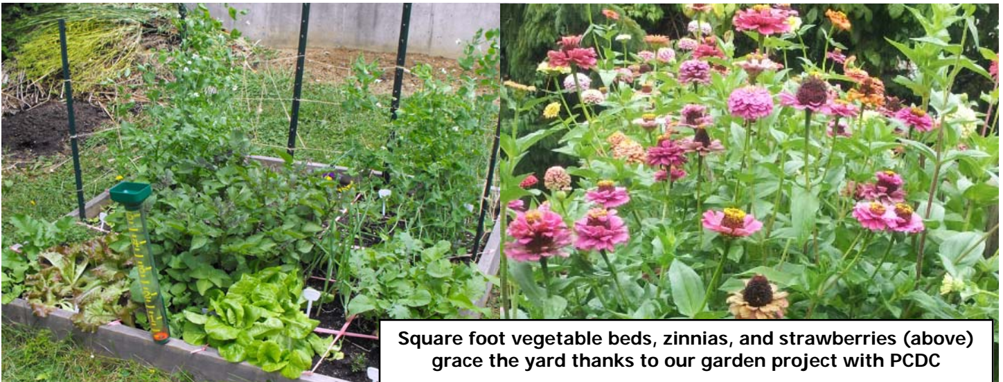
Square foot vegetable beds, zinnias, and strawberries (above) grace the yard thanks to our garden project with PCDC

The 2011 and other earlier work was funded by three 3-years grants of $15,000 each by three granting organizations: Hazel Ruby McQuain Foundation; John Mathew Gay Brown Family Foundation; George D. Hott Memorial Foundation to the Rogers House Preservation Fund.